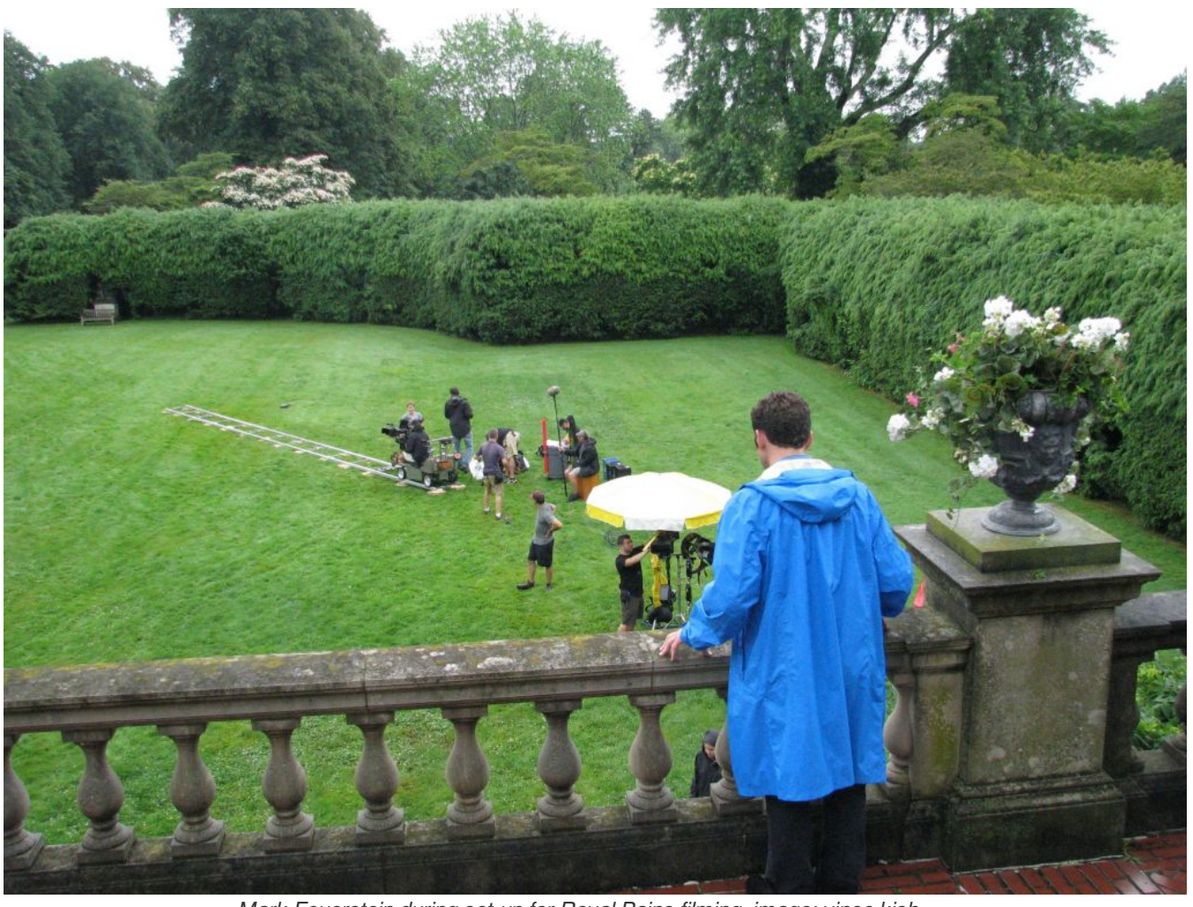
Mark Feuerstein during set-up for Royal Pains filming.

Gardens where Royal Pains is sometimes filmed has been used in more than 20 major films since the 1960s.