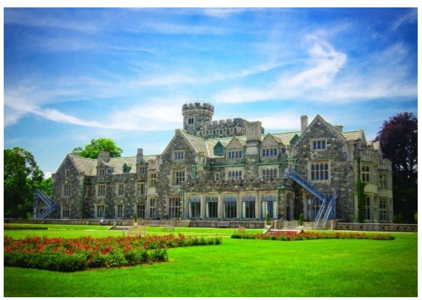
Hempstead House.

Question: what do Royal Pains , Taylor Swift's Blank Space and The Blacklist all have in common?