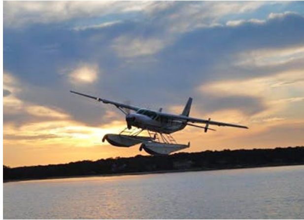
Ready, Jet Set, Go