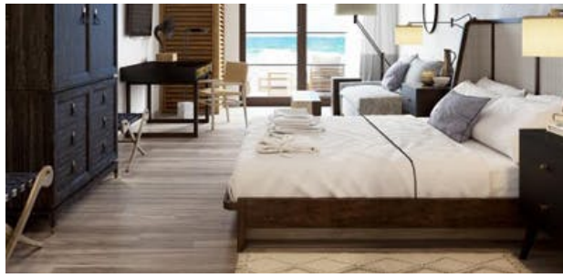
New and Improved