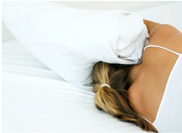
The Morning After