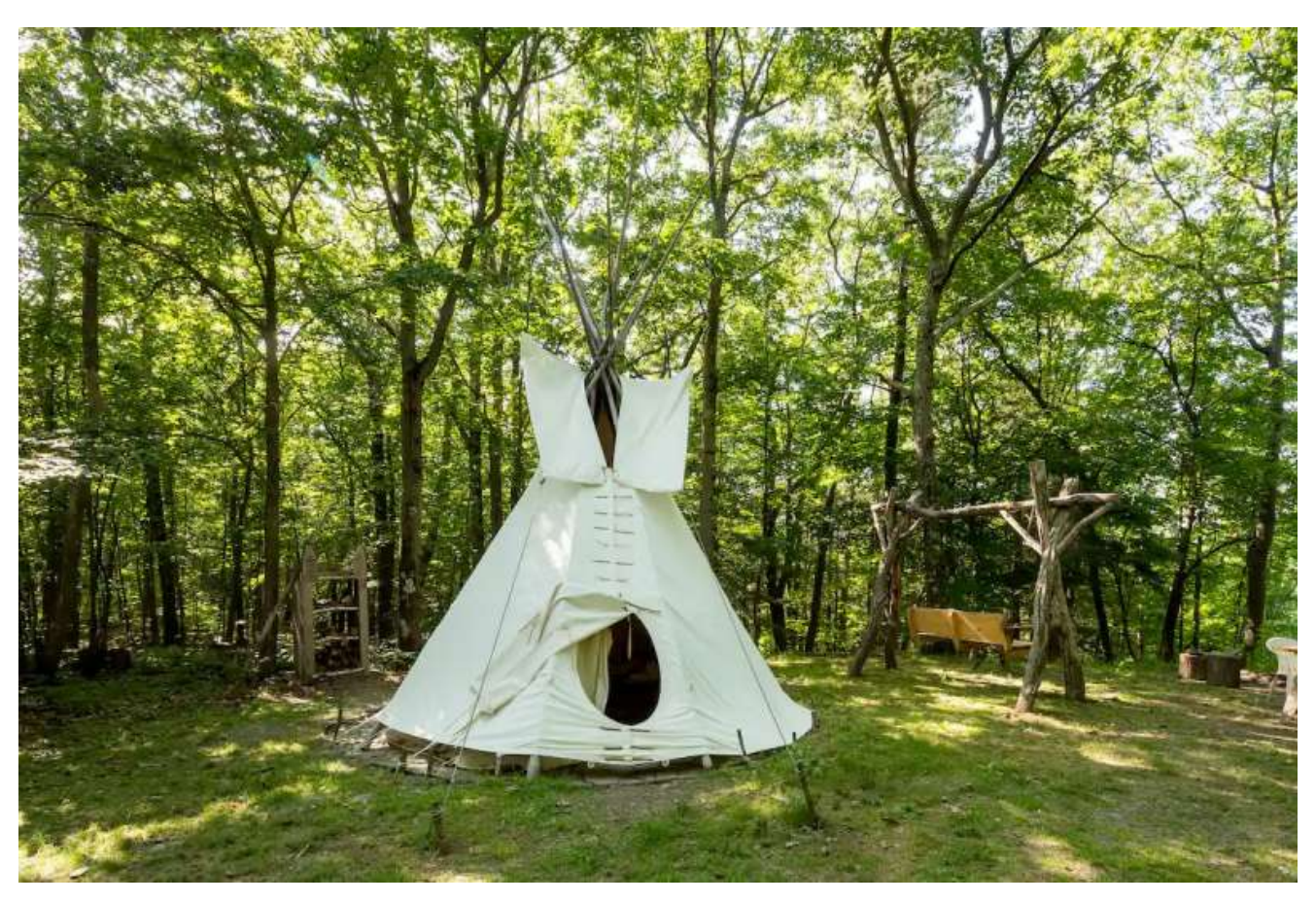
The tipi at Magic Forest Farm. Magic Forest Farm

Magic Forest Farm Camp has something for every type of traveler with several different accommodations ranging from a campsite to furnished tipi to a luxe apartment. Spend your days meeting the animals, including a Guernsey milk cow, goats and a white peacock. You'll learn about organic farming and self-reliance at the homestead and eco-village.