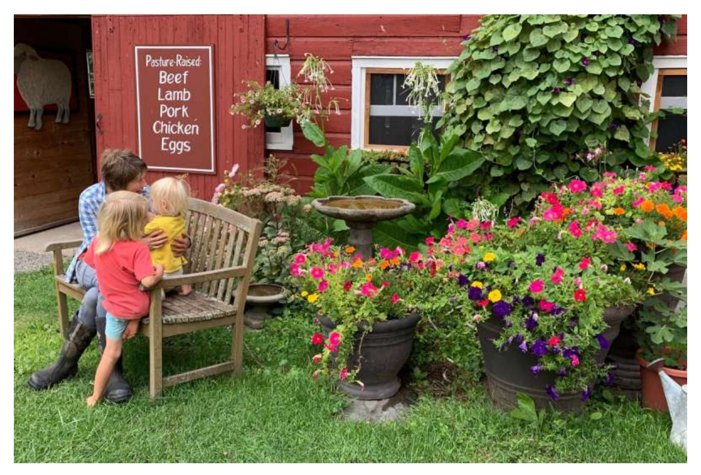
Kinderhook supplies essential gear like high chairs to make it easy to stay with small kids. Kinderhook Farm

Farm Stay at Kinderhook Farm, Columbia County