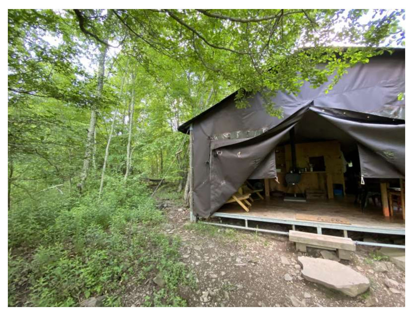
The platform tents are deceivingly rustic; each comes with a kitchen and a king-size bed. Stony Creek Farmstead

Fall asleep as a cow moos nearby at Stony Creek Farmstead. In the morning, you can collect eggs or help with the morning milking. The Walton farm offers platform tents that sleep up to six. Each tent has a king-size bed, a set of bunk beds and a cabinet bed, a fully equipped kitchen, as well as a small closet with a toilet (showers are a short walk away). Also close by are hiking trails and a pond to jump in on hot days. Note: there isn't a place to plug in your phone, but you're on vacation — you weren't going to answer work email, anyway.