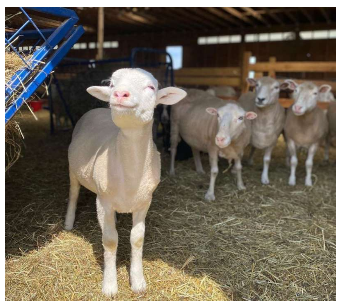
Agritourism experiences give guests a real immersion in farm life and typically support a farm or non-profit's work. Also: you get to spend time with adorable animals. Woodstock Farm Sanctuary

At the 5-bedroom inn Gray Barn in High Falls, guests start the day with a freshly made vegan breakfast — and goat belly rubs. The property is part of the <u>Woodstock Farm Sanctuary</u>, and getting up close and personal with the rescue animals is part of the appeal.