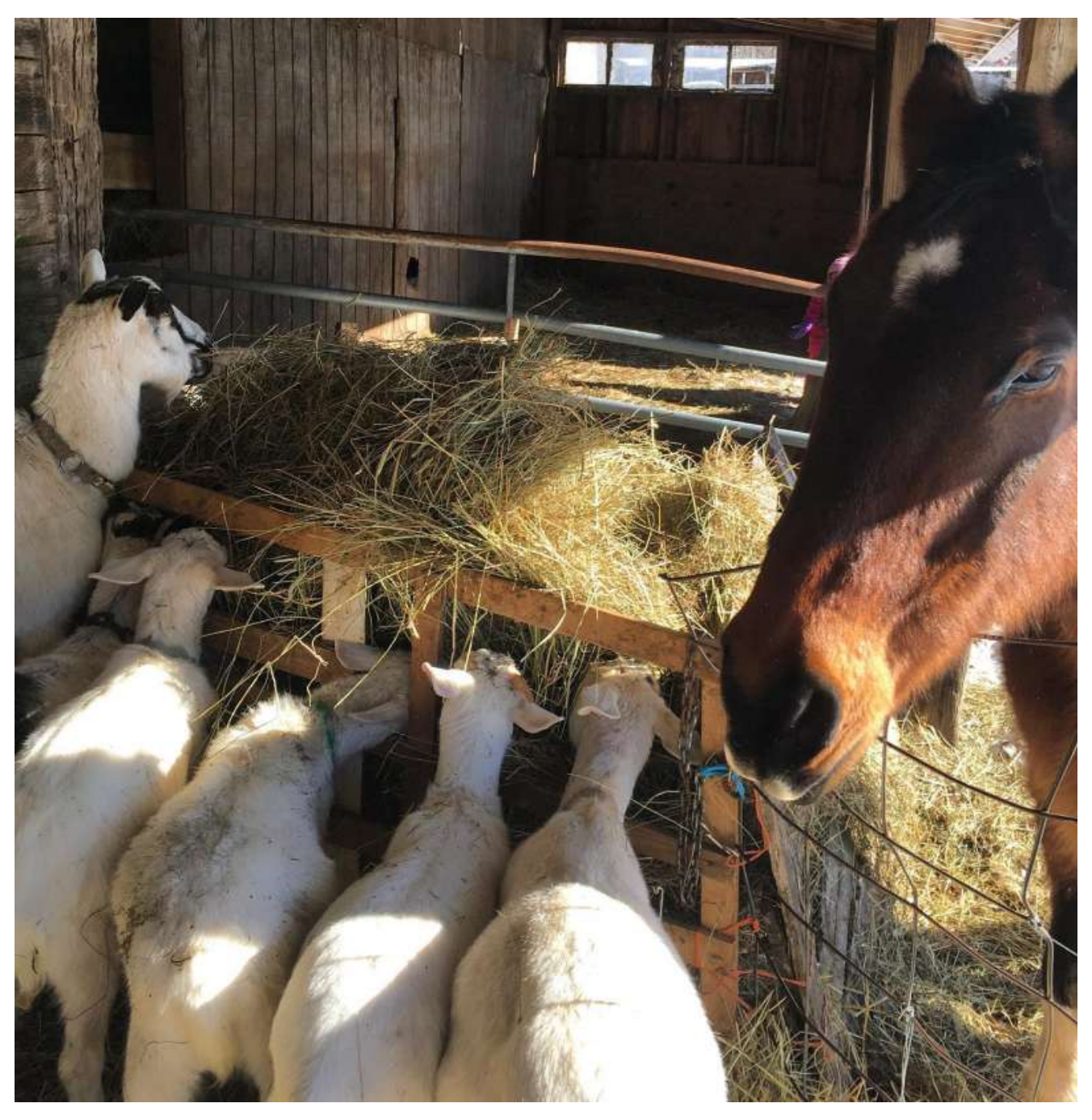
Apple Pond has just one apartment, where up to two guests can experience an intimate farm stay. Apple Pond Farm

This Catskills farm is a true learning center for aspiring farmers and off-the-grid enthusiasts to learn from farmers who are skilled in renewable energy, raising livestock and organic growing. HostsSonja Hedlund and partner Dick Riesling will provide as much hands-on learning as you desire on their 80-acre farm where they grow organic vegetables, raise animals, and produce 90 percent of their electricity on site through solar, wind and other renewable sources. There is a two-night minimum stay in their one-bedroom, dog-friendly loft, suitable for a small child as well.