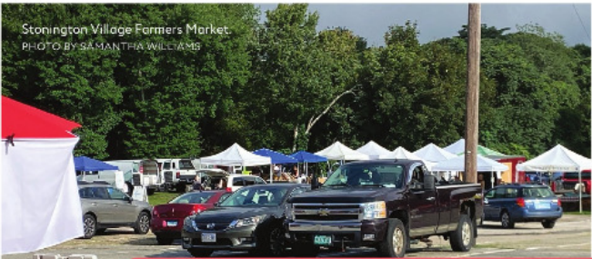
Stonington Village Farmers Market.

Is there anything better than strolling through a farmers market sipping kombucha or iced coffee and scooping up fresh local berries on a Saturday morning? If you, too, think not, make a plan to visit the Stonington Village Farmers Market on a Saturday between 9 a.m. and noon outside the Velvet Mill. Don't forget to stop in to the Velvet Mill afterward and check out the ever-growing shops by local artisans.