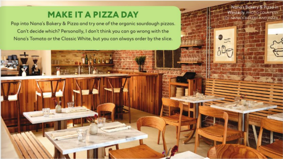
Nana's Bakery & Pizza in Westerly.

Pop into Nana's Bakery & Pizza and try one of the organic sourdough pizzas. Can't decide which? Personally, I don't think you can go wrong with the Nana's Tomato or the Classic White, but you can always order by the slice.