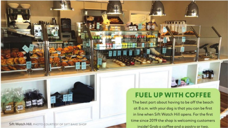
Sift Watch Hill.

The best part about having to be off the beach at 8 a.m. with your dog is that you can be first in line when Sift Watch Hill opens. For the first time since 2019 the shop is welcoming customers inside! Grab a coffee and a pastry or two.