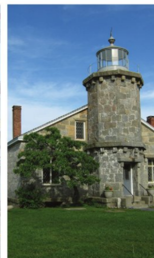
Stonington Lighthouse. SUBMITTED PHOTO