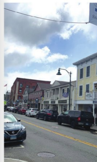
Downtown Mystic.

It's summertime and the days are long, lazy and full of endless opportunities to explore. From the beaches to the charming downtowns to the incredible food, Mystic, Stonington and Westerly are made for summer. Here's how to make the most of a few days along the shoreline.