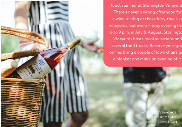
Stonington Vineyards.

Is there anything better than strolling through a farmers market sipping kombucha or iced coffee and scooping up fresh local berries on a Saturday morning? If you, too, think not, make a plan to visit the Stonington Village Farmers Market on a Saturday between 9 a.m. and noon outside the Velvet Mill. Don't forget to stop in to the Velvet Mill afterward and check out the ever-growing shops by local artisans.