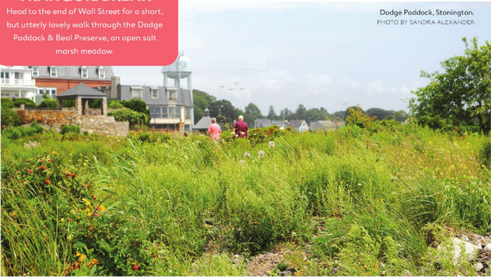
Dodge Paddock, Stonington.

Head to the end of Wall Street for a short, but utterly lovely walk through the Dodge Paddock & Beal Preserve, an open salt marsh meadow.