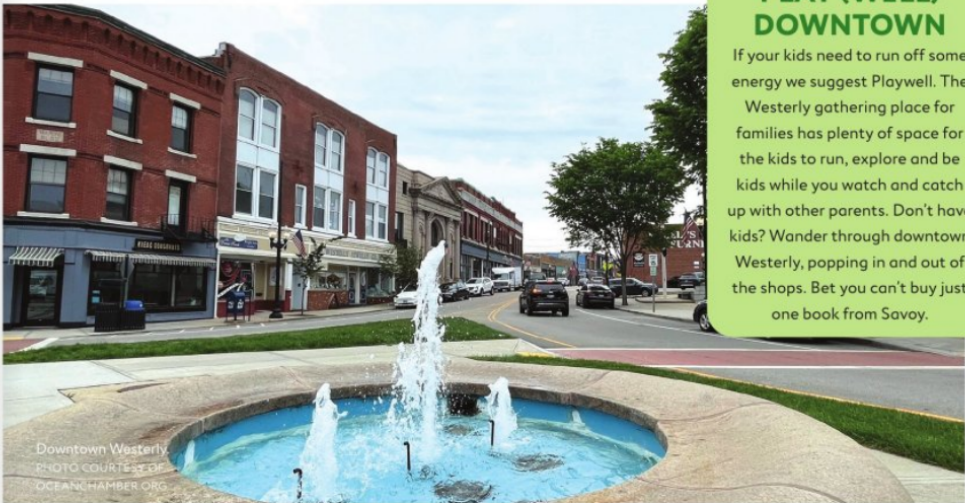
Downtown Westerly.

The best part about having to be off the beach at 8 a.m. with your dog is that you can be first in line when Sift Watch Hill opens. For the first time since 2019 the shop is welcoming customers inside! Grab a coffee and a pastry or two.