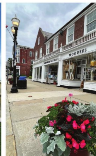
Downtown Westerly.