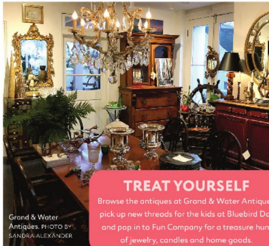
Grand & Water Antiques.

Toast summer at Stonington Vineyards. There's never a wrong afternoon for a wine tasting at these fairy-tale-like vineyards, but every Friday evening from 6 to 9 p.m. in July & August, Stonington Vineyards hosts local musicians and several food trucks. Reserve your spot online, bring a couple of lawn chairs and a blanket and make an evening of it.